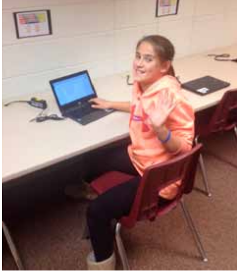
Parents and community members had the opportunity to tour the upgraded keyboarding lab in Pierson during parent-teacher conferences. The new Chromebooks were made possible by a grant from the Missouri River Historical Development.